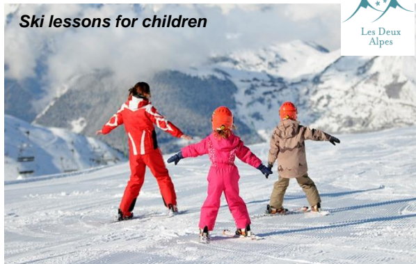
Ski lessons for children