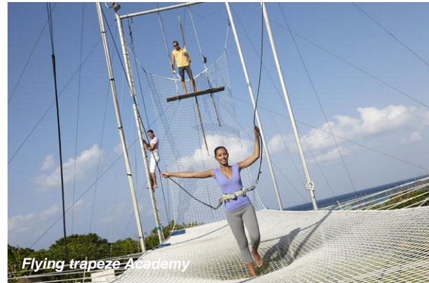
Flying trapeze Academy